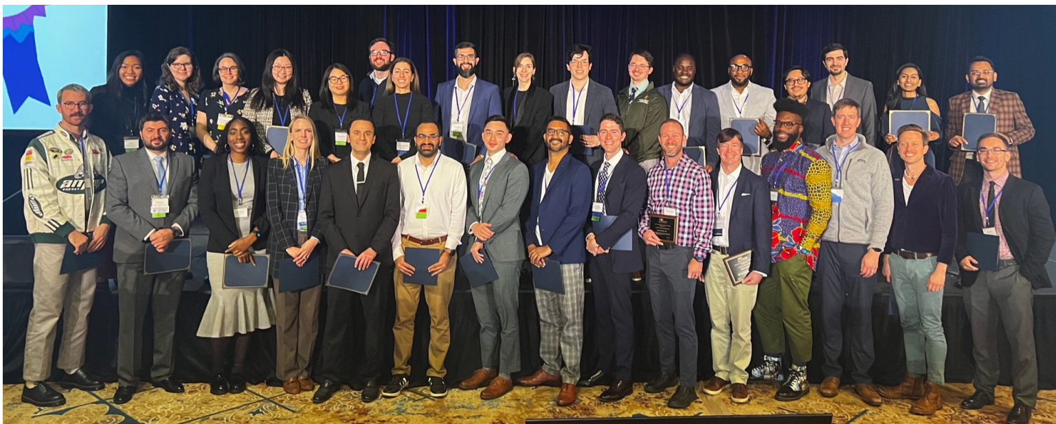
Congratulations to the 2023 Travel Awardees!