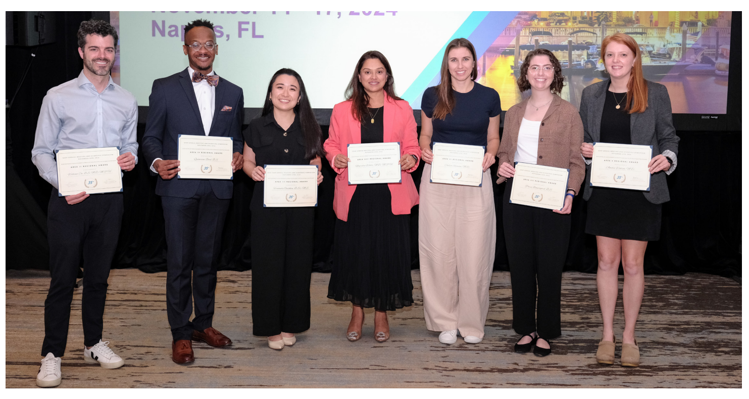
Regional Travel Awardees